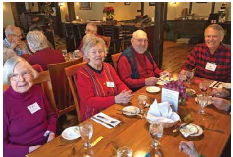
Members Enjoying Our Holiday Lunch.