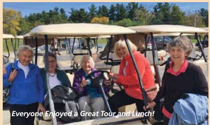
Everyone Enjoyed a Great Tour and Lunch!

At tour’s end our jolly caravan returned inspired by viewing a unique setting where nature and sport blend together. Back at the welcoming Shattuck Clubhouse we enjoyed lunch and MaH’s legendary camaraderie. 📷