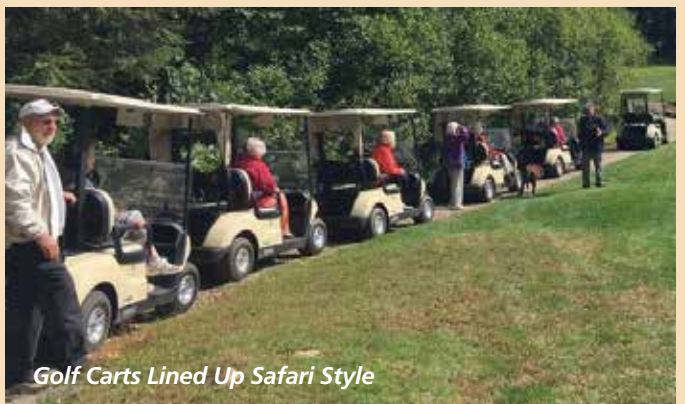
Golf Carts Lined Up Safari Style