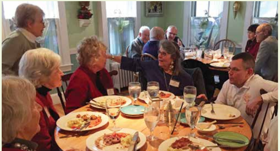
Enjoying a delicious lunch at the Monadnock Inn