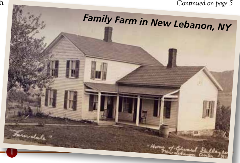
Family Farm in New Lebanon, NY