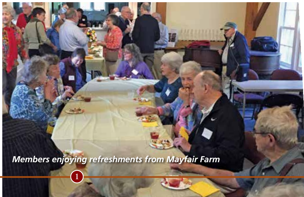
Members enjoying refreshments from Mayfair Farm